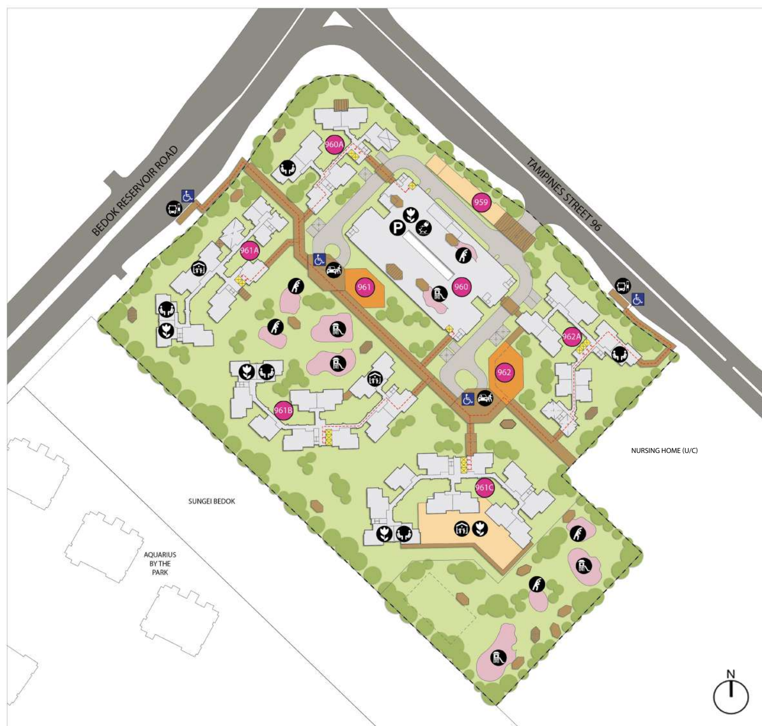
Site plan for Tampines GreenEmerald

மேலும் இதன் வடிவமைப்பு கற்சுரங்கத்தை நினைவூட்டுகிறது. இதில் உள்ள பரந்த மேற்கூரைத் தோட்டம் கற்சுரங்கத் தோற்றத்தில் அமைந்துள்ள சில அடுக்குமாடிகளில் உள்ளது. அதுமட்டுமல்லாமல் ஒரு பிள்ளைகளுக்கான