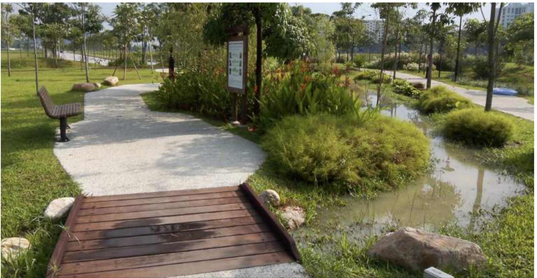
ABC Waters design features