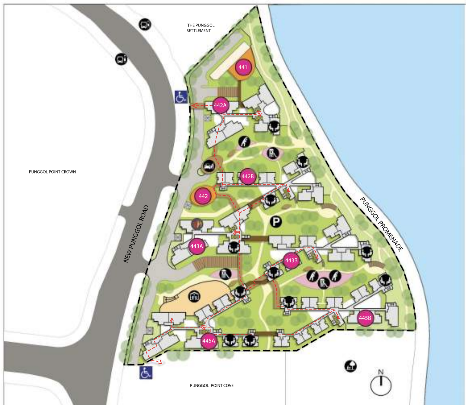
Site plan for Punggol Point Cove

"Punggol Point Cove" என்ற பெயர் மீன்பிடி கிராமம், பின்னர் மீன்பிடி துறைமுகமாக இருந்த பொங்கோல்-ன் ஆரம்பக்கால ஞாபகமாகக் சூட்டப்பட்டுள்ளது. புளோக்குகளின் தனித்துவமான அலை போன்ற வடிவமைப்பு தடையற்று காணப்படும் நீர்நிலையையும், மீன் வலைகளையும் பிரதிபலிக்கிறது.