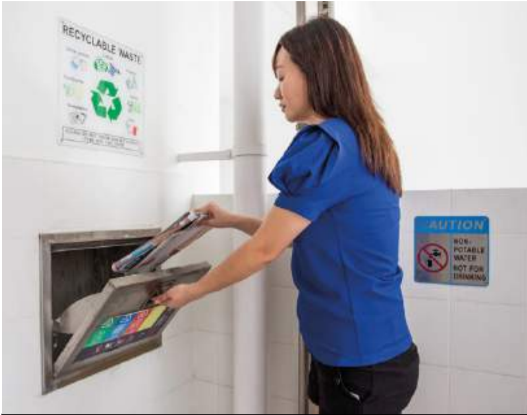
Separate chutes for recyclable waste

In a bid to go green for the earth, Punggol Point Cove is designed with several eco-friendly features such as Smart Pneumatic Waste Conveyance System to optimize the deployment of resources for cleaner and fuss-free waste disposal; Smart-Enabled homes with provisions to support easy installation of smart systems; separate chutes for recyclable wastes; regenerative lifts to reduce energy consumption; bicycle stands to encourage cycling as an environmentally friendly form of transport; motion sensor-controlled energy efficient lighting at staircases and regenerative lifts to reduce energy consumption; and parking spaces to facilitate future provision of EV charging.