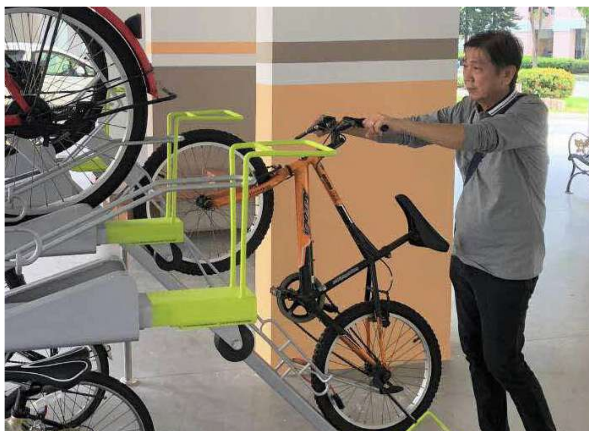
Bicycle stands to encourage cycling