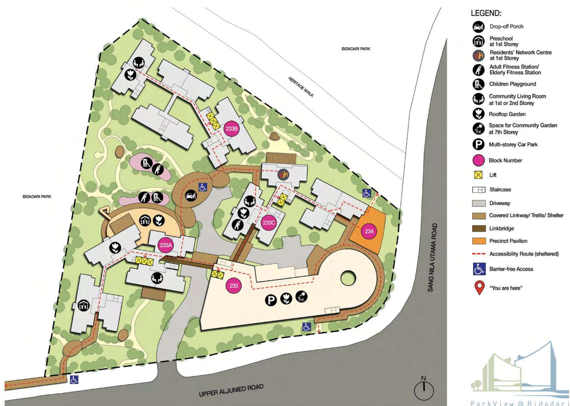
Site plan for ParkView @ Bidadari

ParkView @ Bidadari-யில் உள்ள குடியிருப்புகள் எதிரெதிராக அமைந்திருக்கின்றன. இதனால் மறைவற்ற ஒரு திறந்தவெளி அமைப்புக் கிடைக்கின்றது.