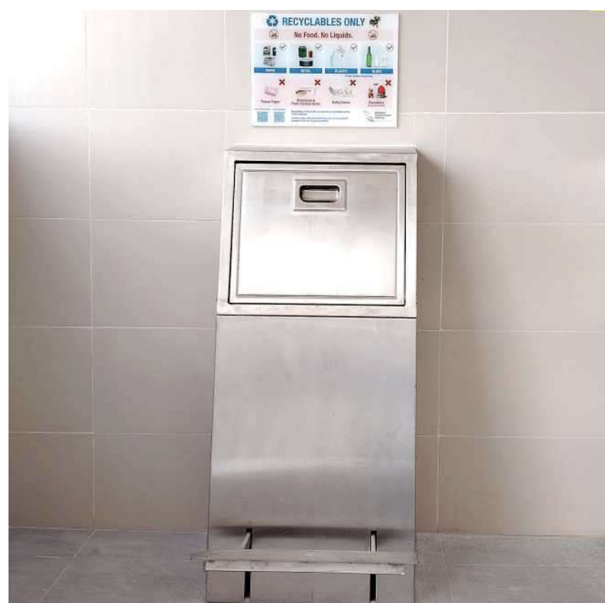
Separate chutes for recyclable waste

ParkView @ Bidadari also features Smart Lighting in the common areas to reduce energy usage and Smart Pneumatic Waster Conveyance System to optimise the deployment of resources for cleaner and fuss-free waste disposal. These will contribute to a more liveable, efficient, sustainable and safer living environment.