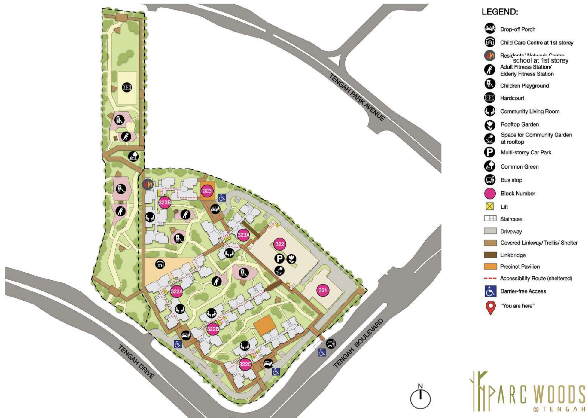
Site plan for Parc Woods @ Tengah

Explore the Tengah Webpage for the latest updates on Tengah town including when the new amenities, facilities and developments are completing. You can look forward to upcoming developments such as a suite of new amenities and facilities, and improved connectivity within your neighbourhood in the coming months.