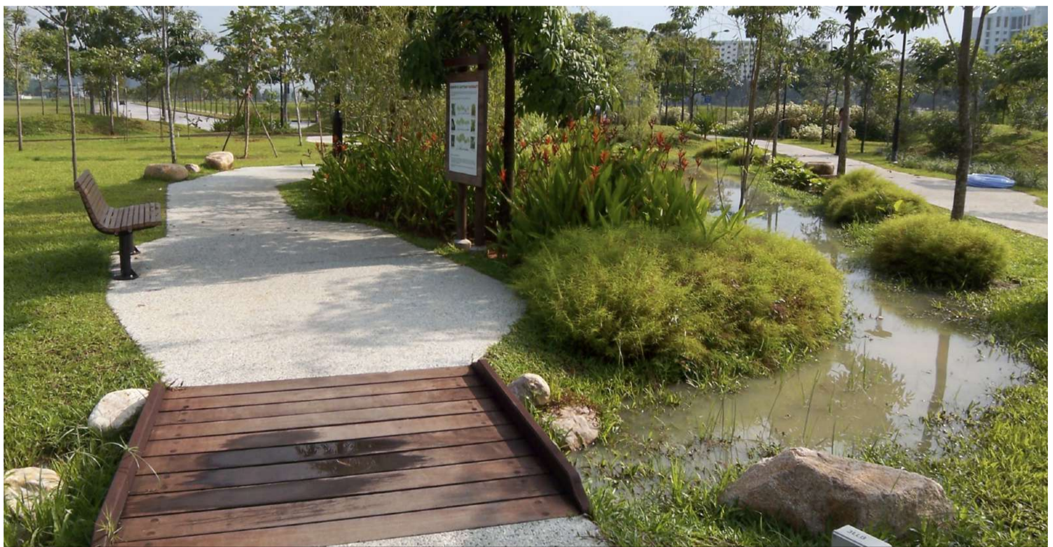
ABC Waters design features

© 2024 Housing & Development Board. All rights reserved.