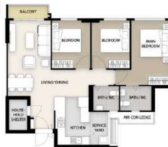
4 Room with Balcony