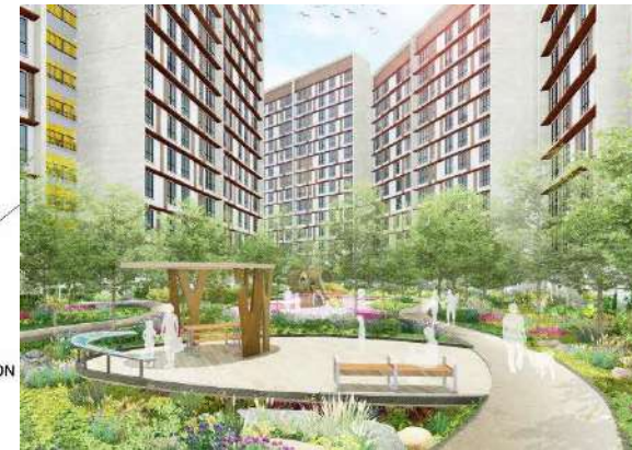
FLOATING DECK & PLAYGROUND