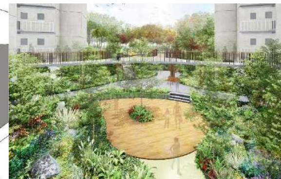
ENTRY PLAZA FROM BIDADARI PARK