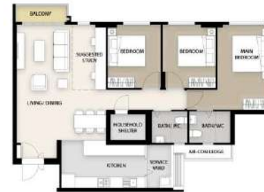
5 Room with Balcony