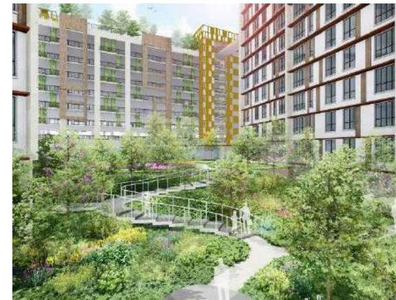
BOARDWALK & EDUCATIONAL TRAIL