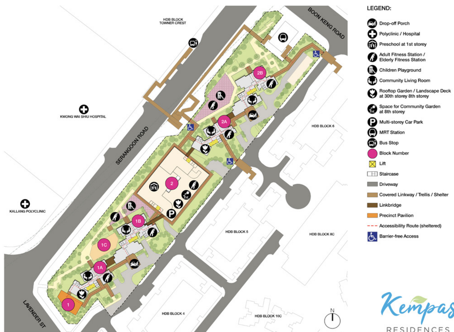
Site plan for Kempas Residences

இந்த மேம்பாட்டில் 29 முதல் 37 மாடிகள் வரையிலான 4 குடியிருப்புத் தொகுதிகள் அடங்கியுள்ளன, அவற்றில் 2-அறை ஃப்ளெக்ஸி, 3-, மற்றும் 4-அறை வீடுகள் என மொத்தம் 583 வீடுகள் உள்ளன. இந்த மேம்பாட்டில் உள்ள 2-அறை ஃப்ளெக்ஸி வீடுகள், 15 முதல் 45 ஆண்டுகள் வரையிலான குறுகியகாலக் குத்தகையில் (5 ஆண்டு அதிகரிப்புகளில்) முதியவர்களுக்காக (55 மற்றும் அதற்கு மேற்பட்ட வயதினர்) ஒதுக்கப்பட்டுள்ளன.