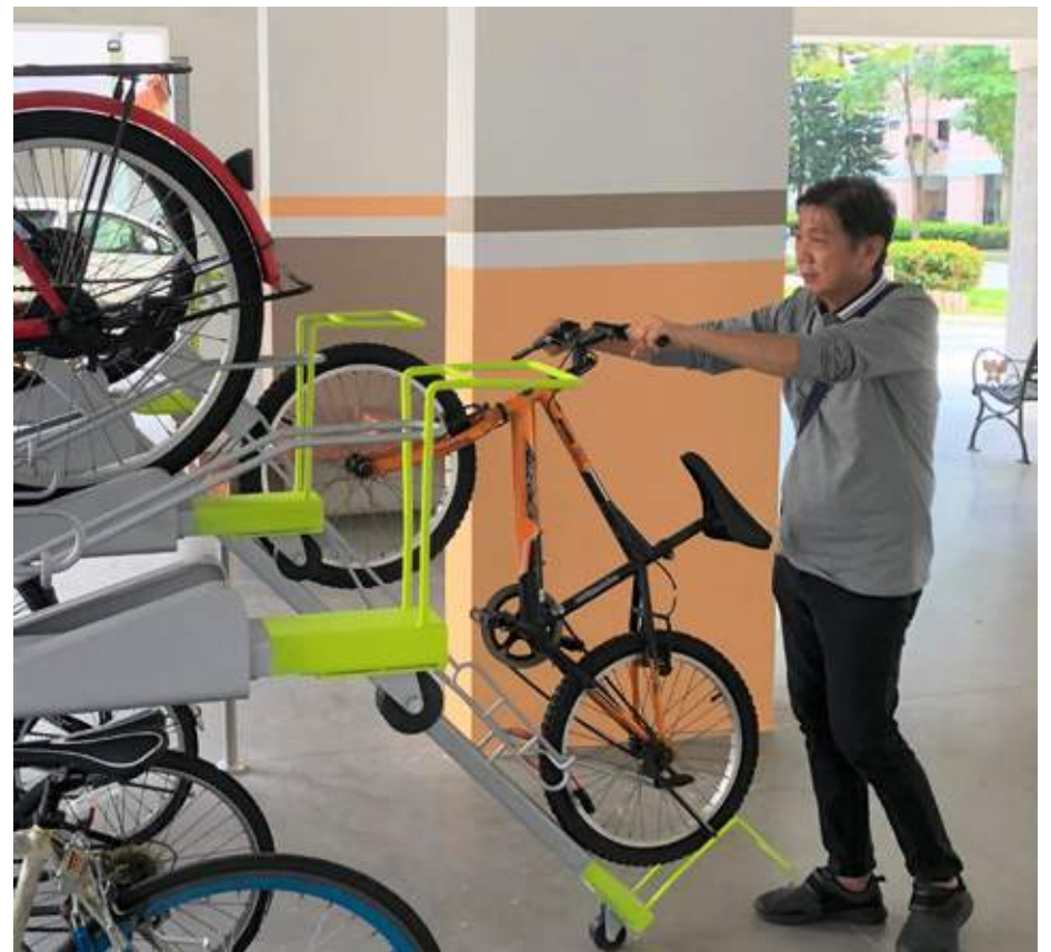
Bicycle stands to encourage cycling