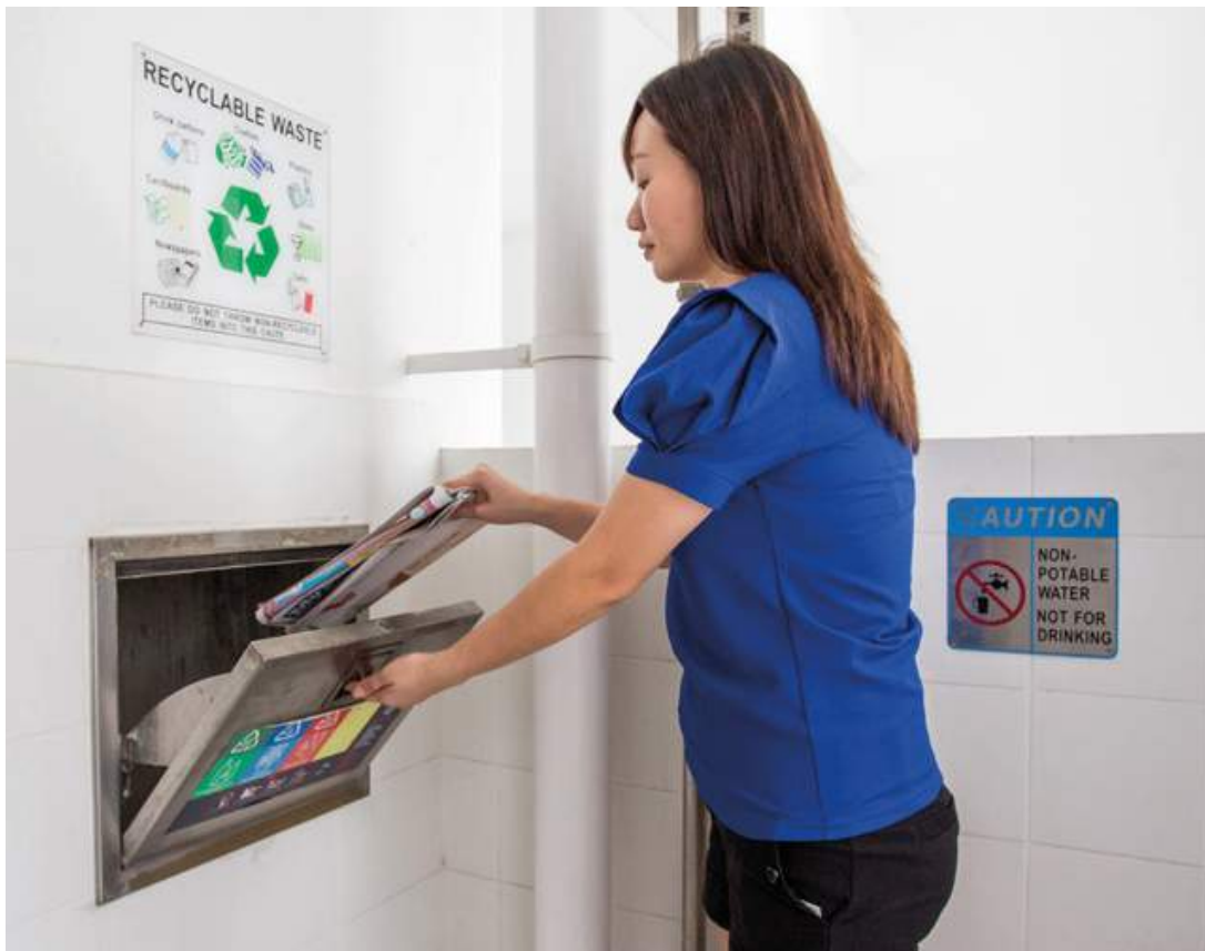
Separate chutes for recyclable waste