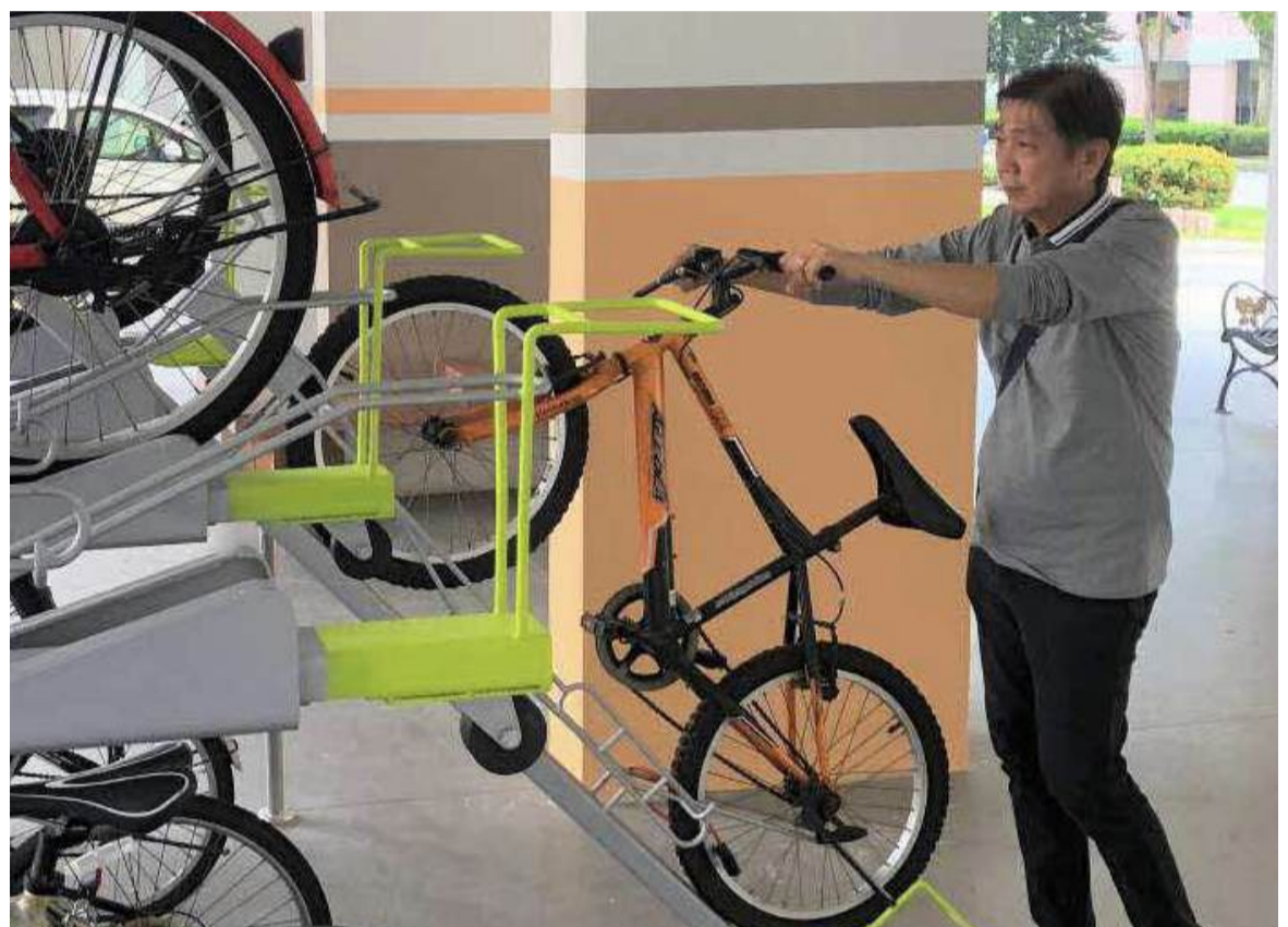
Bicycle stands to encourage cycling