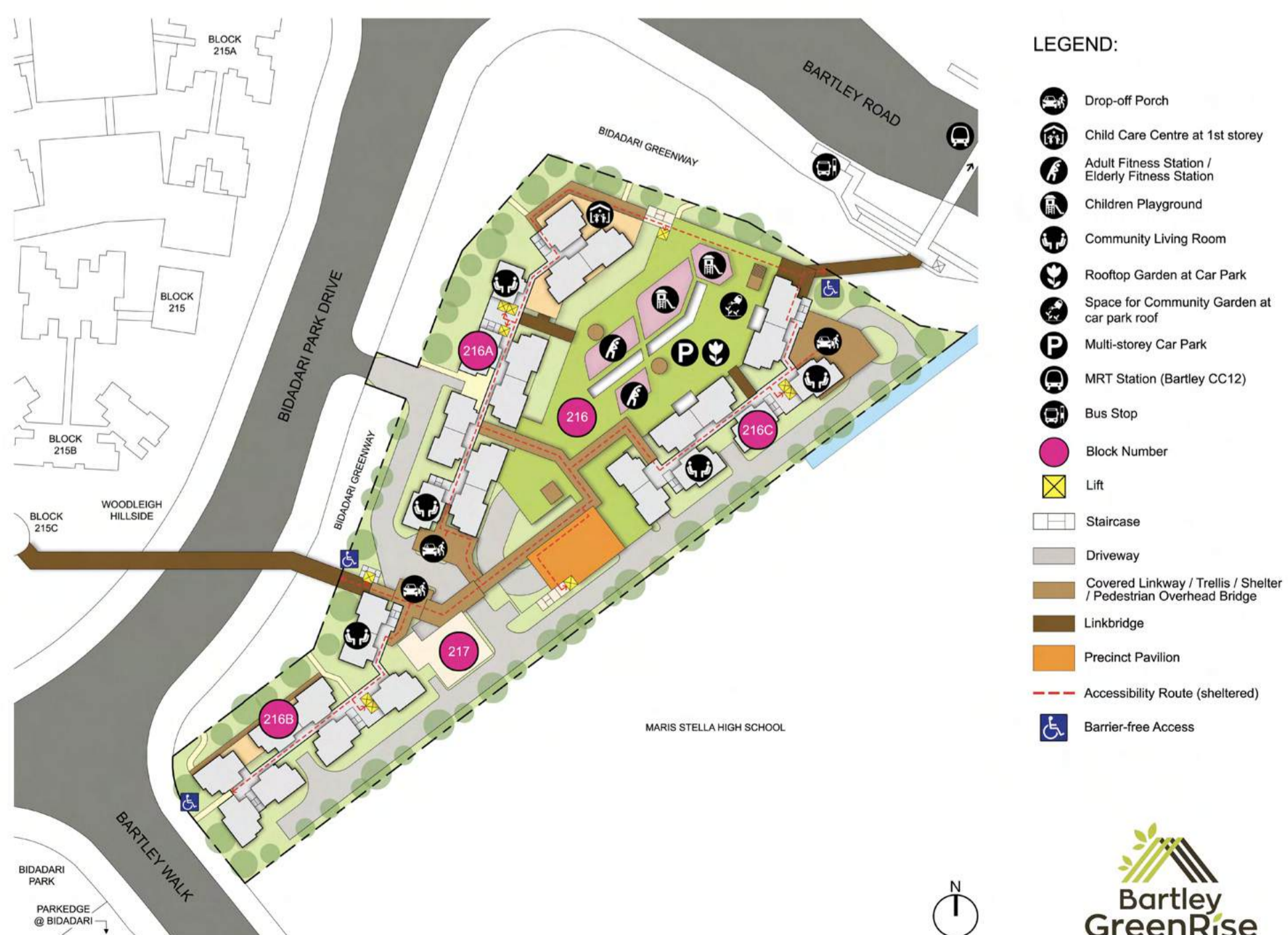
Site plan for Bartley GreenRise

இதற்கு Bartley GreenRise, என்று பெயரிடக் காரணமாக இருப்பது அவ்வளாகத்திற்குள் அடித்தளம் முதல் கார்நிறுத்த கூரைத் தோட்டம் வரை மற்றும் அடுக்குமாடிக் குடியிருப்புகளில் காணப்படும் பல நிலைகளினால் ஆன பசுமையான பகுதிகளே ஆகும்.