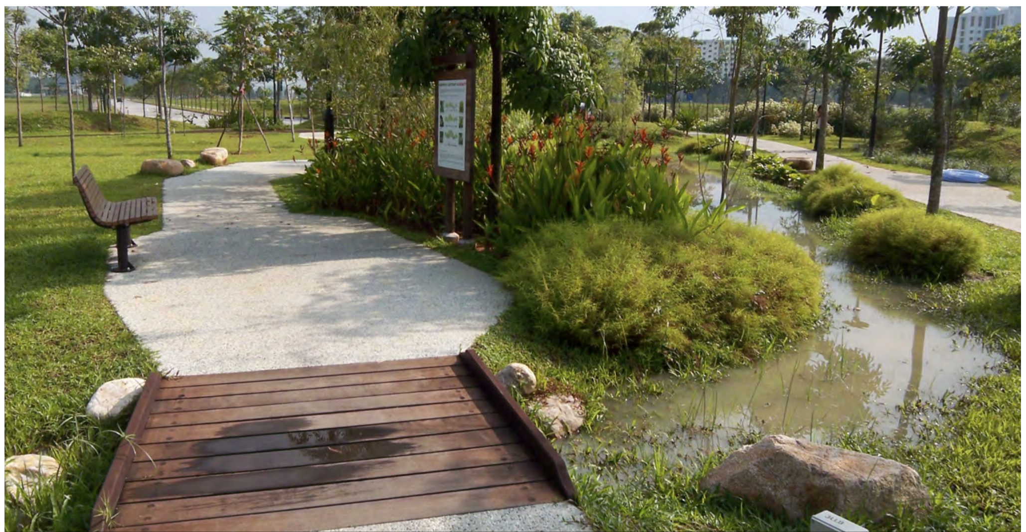
ABC Waters design features

© 2025 Housing & Development Board. All rights reserved.