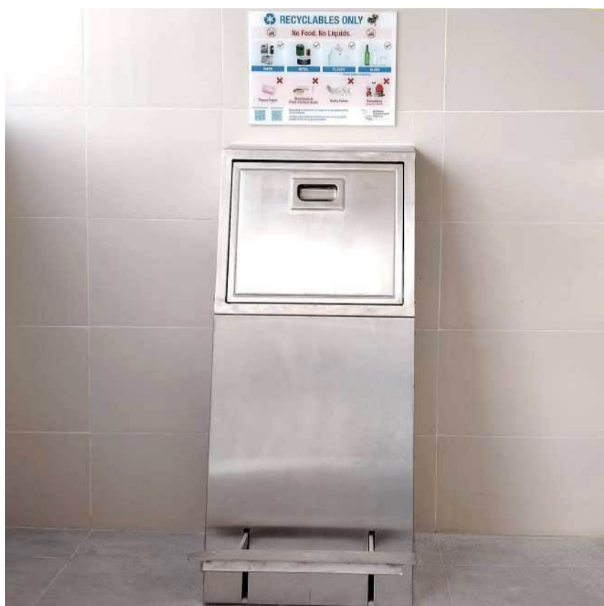
Separate chutes for recyclable waste

All these will contribute to a more liveable, efficient, sustainable and safer living environment.