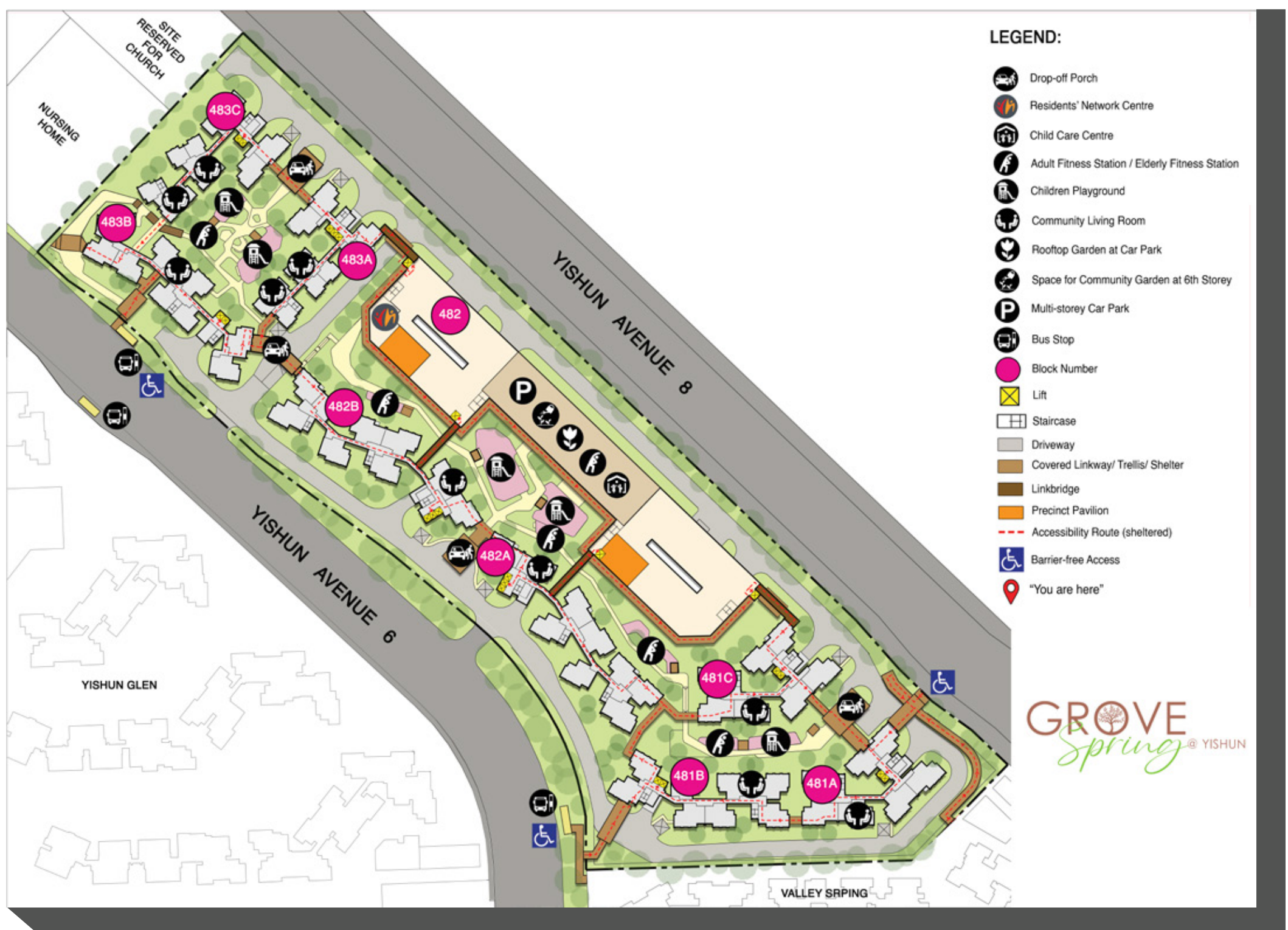
Site plan for Grove Spring @ Yishun

இக்கட்டுமானத் திட்டத்திற்கு 'Grove Spring @ Yishun' என்று பெயரிடப்பட்டதற்கு முக்கியக் காரணம், இதன் முகப்பு காட்டின் மண் சார்ந்த நிறங்களில் மரத்தோப்பு போல் காட்சியளிப்பதே ஆகும்.