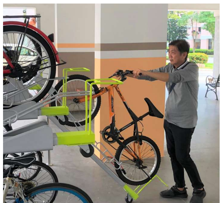
Bicycle stands to encourage cycling