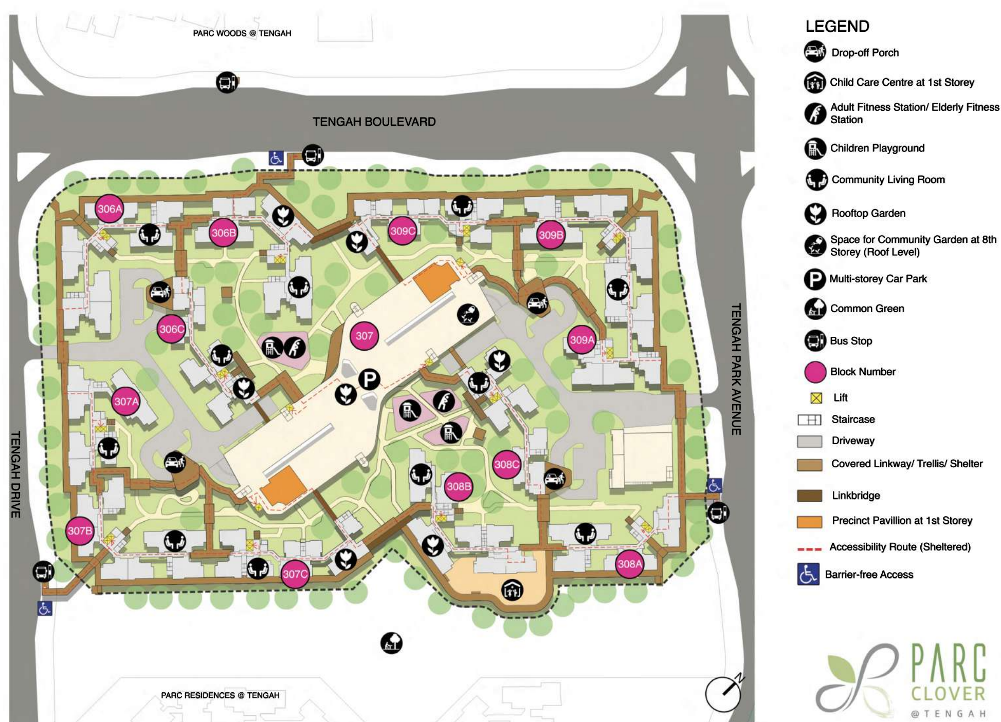
Site plan for Parc Clover @ Tengah

Explore the Tengah Webpage for the latest updates on Tengah town, including when the new amenities, facilities and developments are completing.