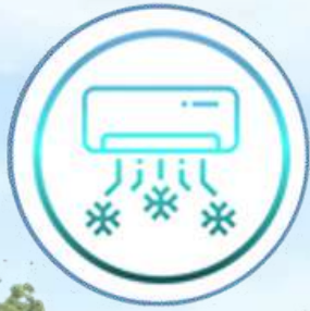
Centralised Cooling System