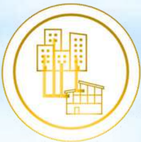
Pneumatic Waste Conveyance System

Green living in Tengah is made accessible through the use of smart technologies and environmental studies, to create a sustainable and comfortable environment, while enabling residents to benefit from more efficient services and greater convenience.