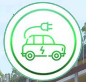
Electric Vehicle-ready car park