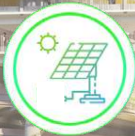
Solar Photovoltaic panels