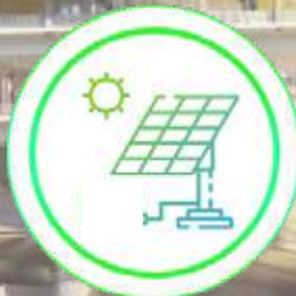
Solar Photovoltaic panels