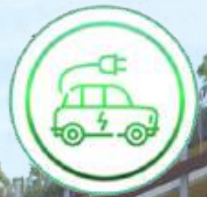
Electric Vehicle-ready car park