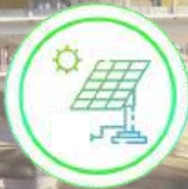
Solar Photovoltaic panels