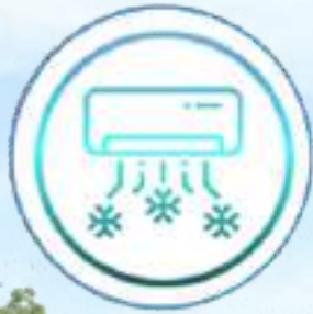
Centralised Cooling System