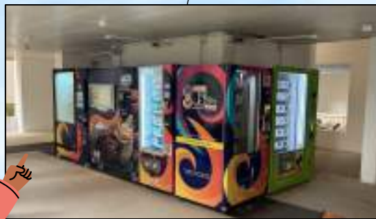
Vending machines located at void deck of Blk 111A Plantation Cres

Blk 440 Bukit Batok West Ave 8 Supermarket, Eating House, Shops