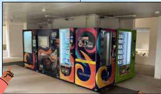
Vending machines located at void deck of Blk 111A Plantation Cres

Blk 440 Bukit Batok West Ave 8 Supermarket, Eating House, Shops